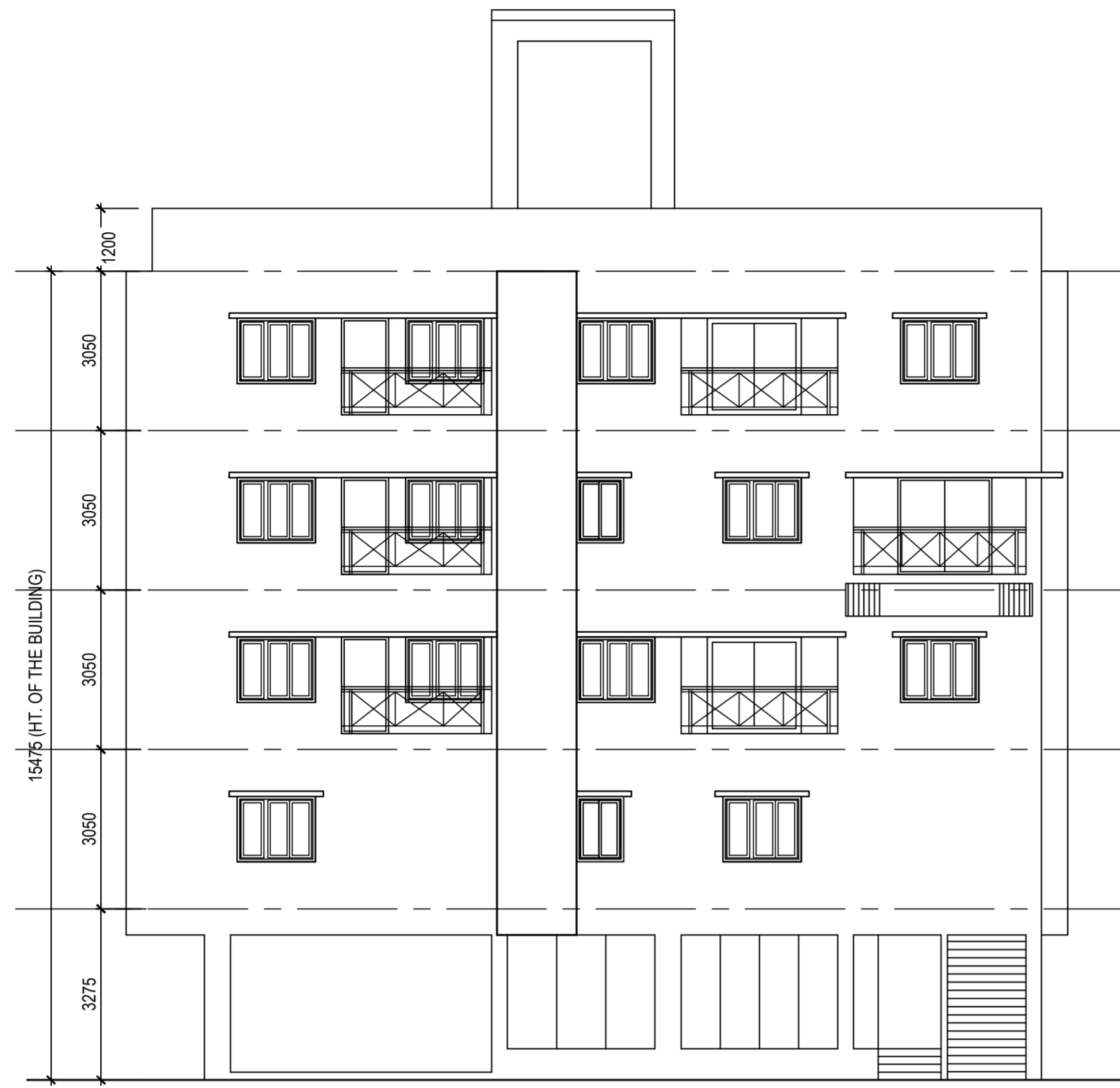
FRONT (SOUTH) SIDE ELEVATION SCALE :- 1:100